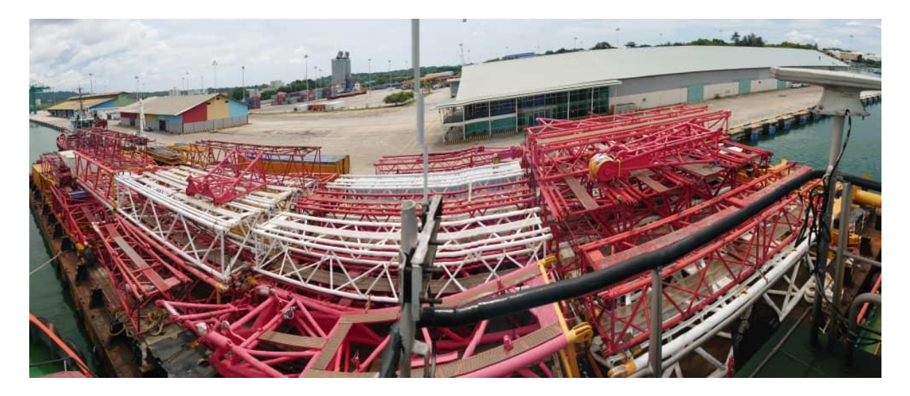
Marine Transportation of assets back to Singapore

Our lifting and marine teams had to work within an hour on the day of departure to commence the RORO operation as they can only depart during the highest tide that happens in a short period within a day. During that short period, the team had a Mobile Crane at the pier to setup ramps to connect it to the Barge, allowing the remaining assets to move onto the Barge.